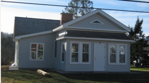
The Bell House (lower and upper apartments).